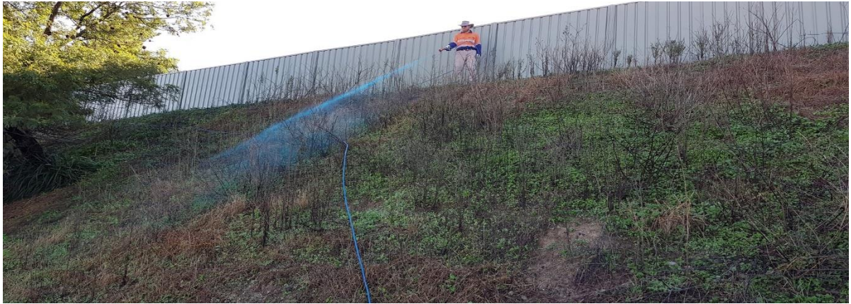
Figure 1 – Herbicide spraying in Area 3