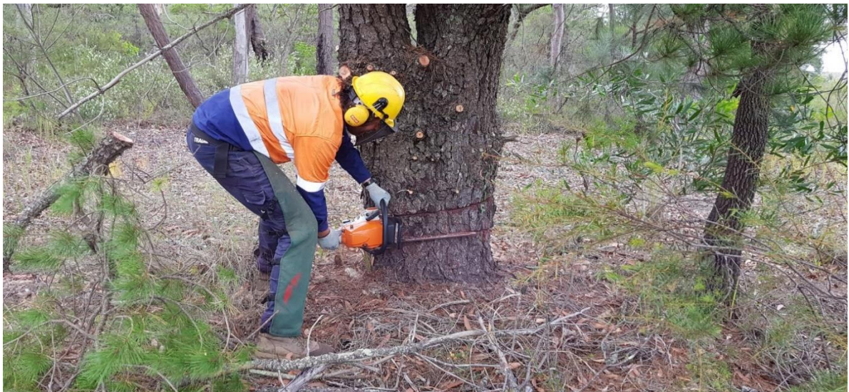
Figure 2 – Frill-and-fill of P. radiata