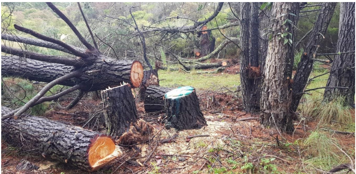
Figure 3 – Felling of P. radiata