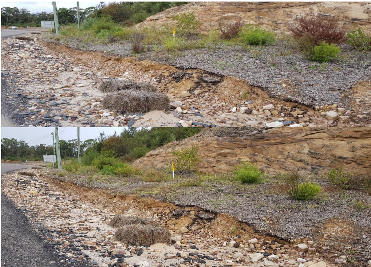
Figure 2 – Before/After brush-cutting works