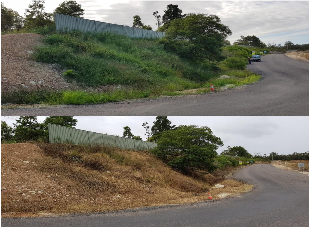
Figure 1 – Before/After herbicide application from previous visits