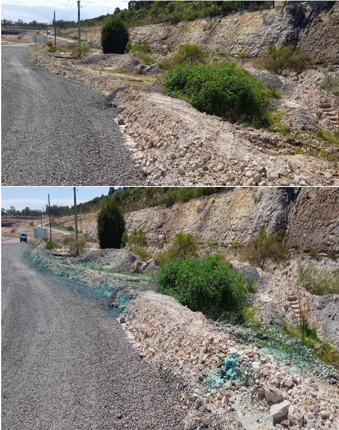
Figure 1: Before/After herbicide application