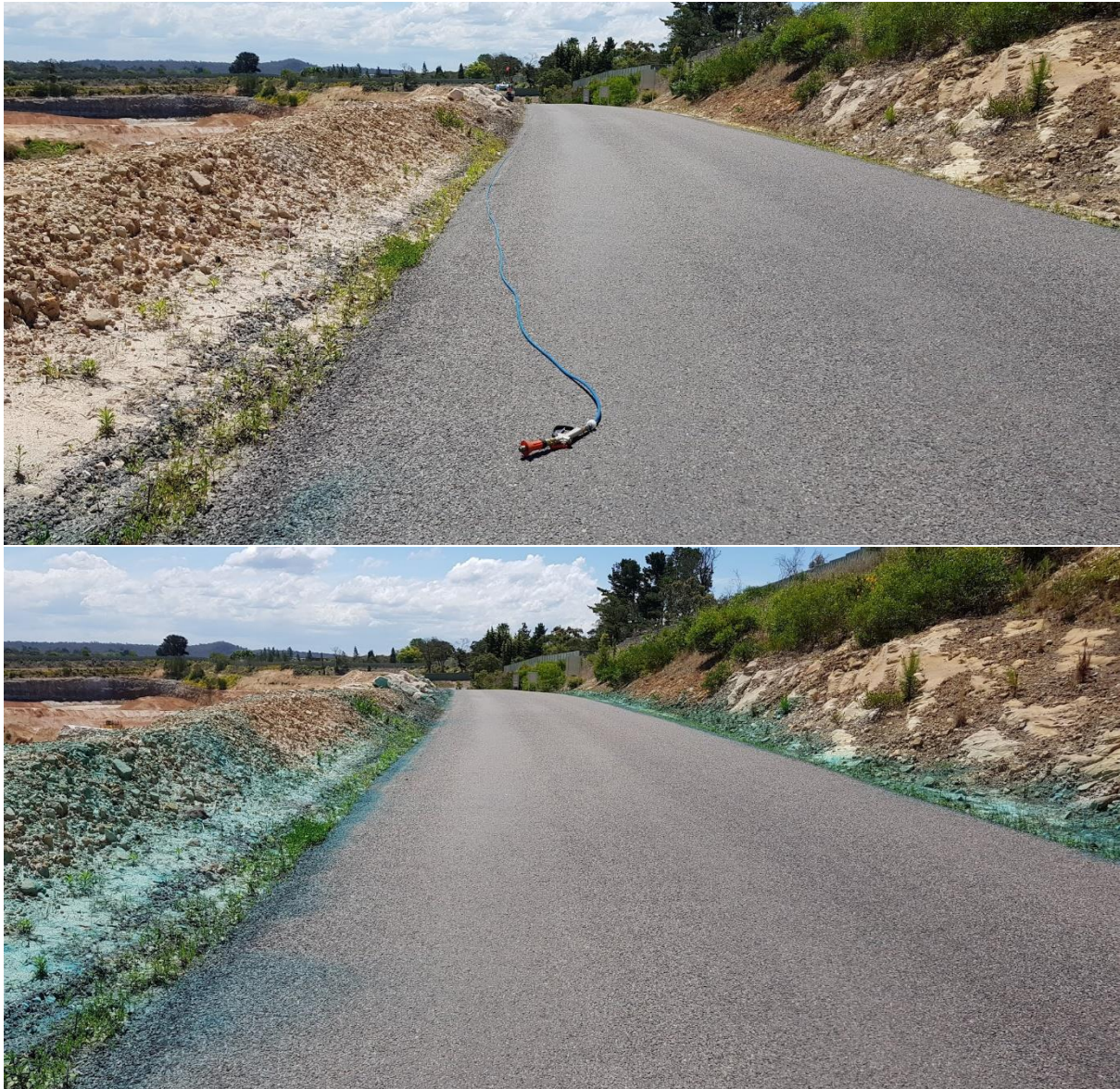
Figure 2: Before/After herbicide application