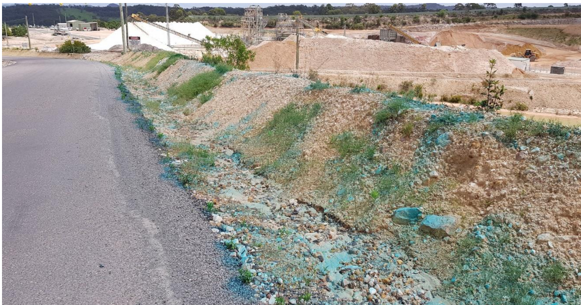
Figure 1 – Before/After herbicide application along roads.