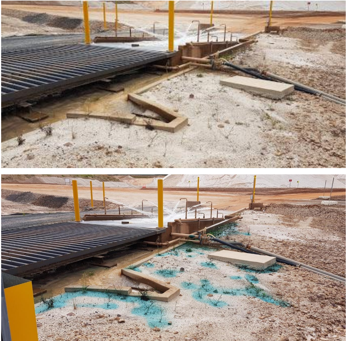
Figure 3 – Before/After herbicide application to invasive tree species in sandstone bun areas