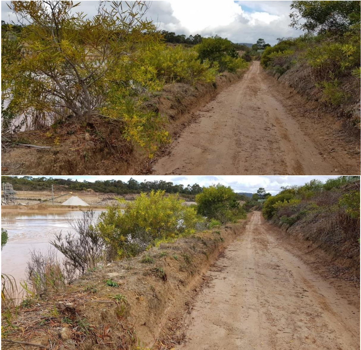
Figure 2 – Removal of trees in Sandstone Bun areas