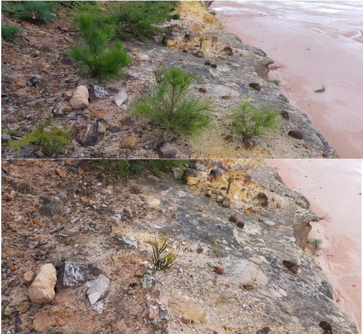
Figure 1 – Cut-and-Paint of P. radiata seedlings