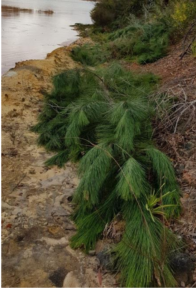
Figure 4 – Felling of P. radiata