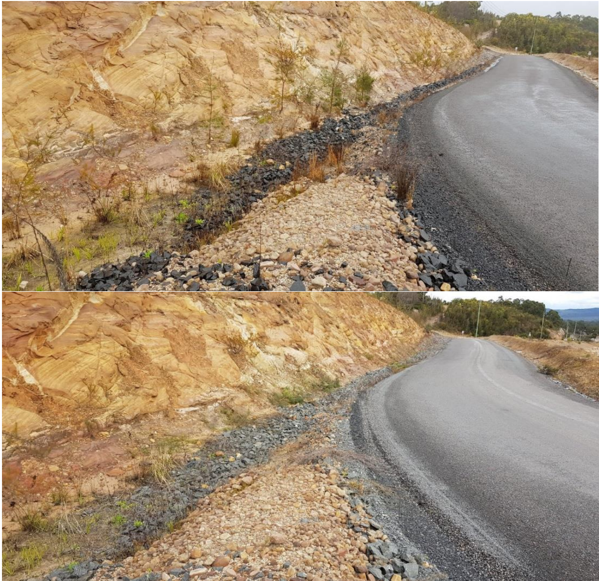
Figure 3 – Before/After Brush-cutting herbaceous weeds near roadside