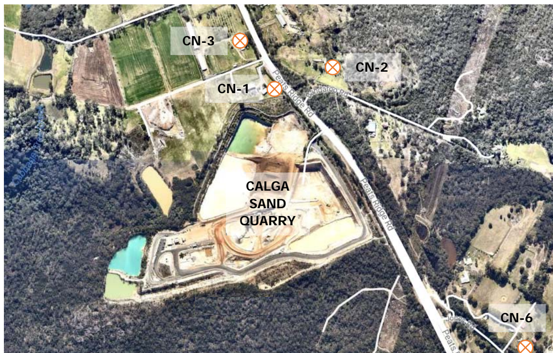
Figure 2-1 Noise Monitoring Locations