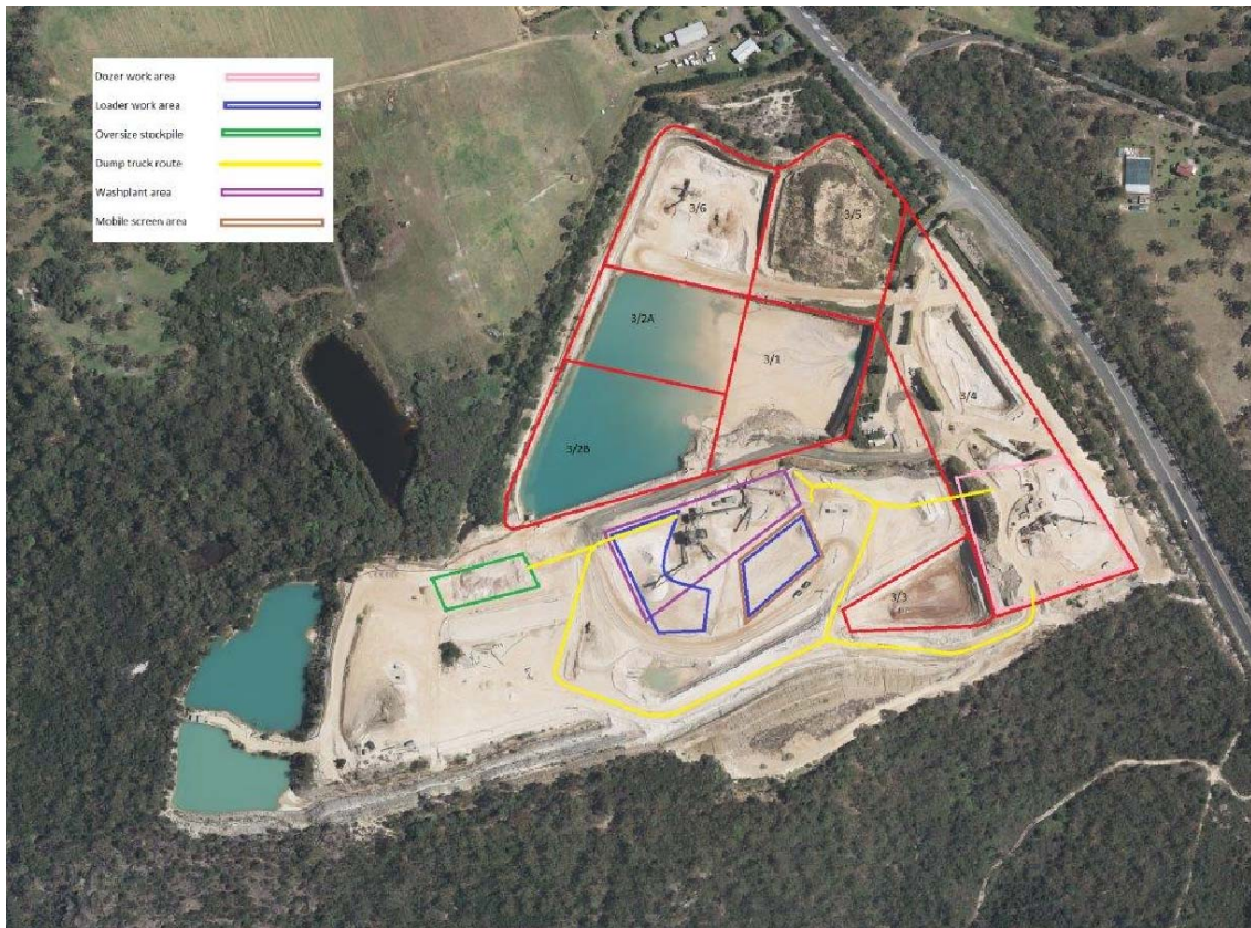
Figure 4-1 Quarry Site Layout and Operational Areas

The following mobile plant and equipment were in operation during the time of the survey. It should be noted however that not all of the items described below were constantly in operation within the operating hours throughout the unattended monitoring period.